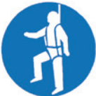
Safety harness must be worn