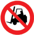
No access for industrial vehicles