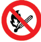
Smoking and naked flames prohibited