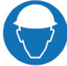
Head protection must be worn