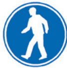
Pedestrians must use this route