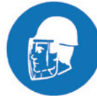
Face protection must be worn