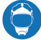
Respiratory equipment must be worn