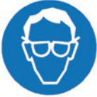
Eye protection must be worn