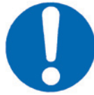
General mandatory sign (to be accompanied by another sign where necessary)