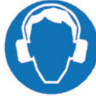
Hearing protection must be worn