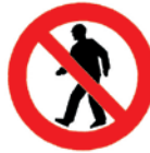
No access for pedestrians