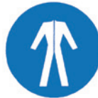
Protective overalls must be worn