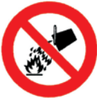
Do not extinguish with water