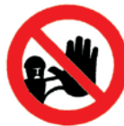
No access for unauthorised persons