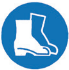
Protective footwear must be worn