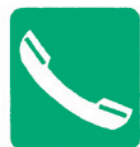
Emergency telephone for calling first aid service, ambulance, police, poison control centre and rescue coordination centre