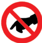
Do not touch