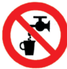
Not drinking water