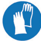
Hand protection must be worn