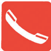
Emergency telephone for calling the fire service